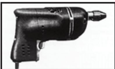
1946 - World's 1st Consumer Drill