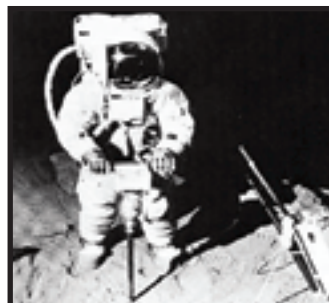
1969 First drill on the moon